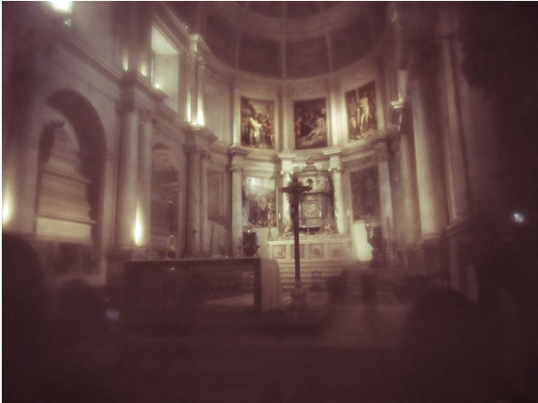
Cathedral in Portugal