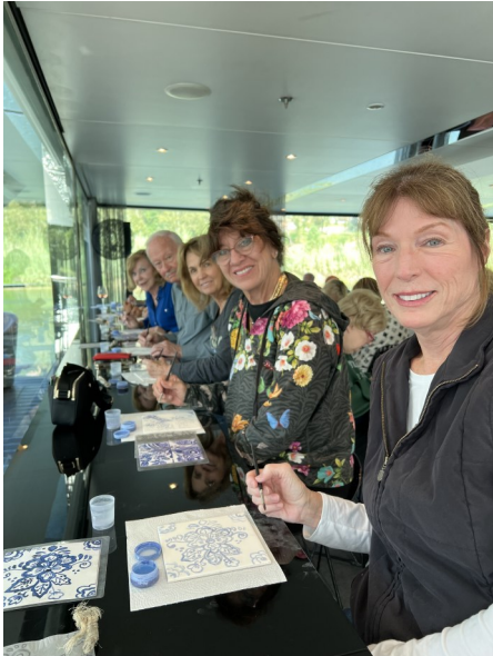
And.... MORE tile painting!!