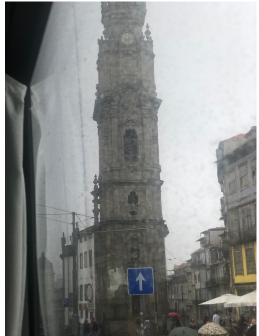
Landmark time tower.....