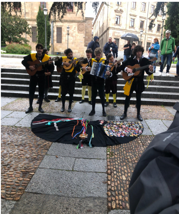
Entertainment for us worldly travelers...!