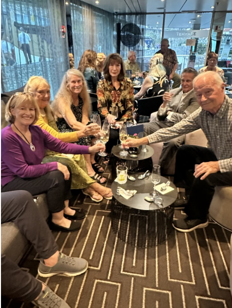
Cruising the river.....