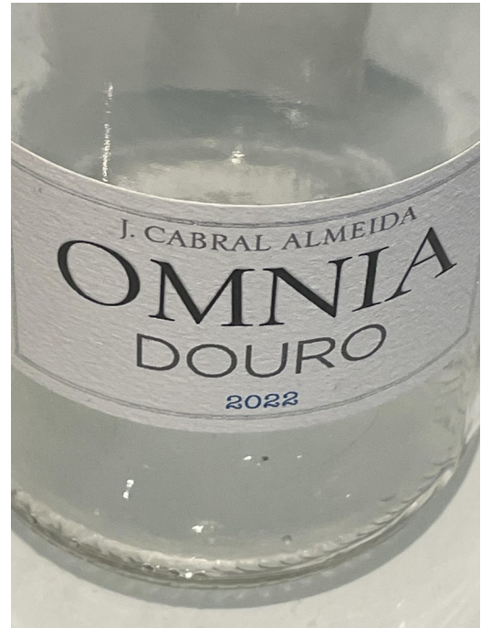
Portugal bottle of wine.....