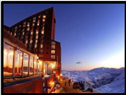
Hotel Puerto Del Sol