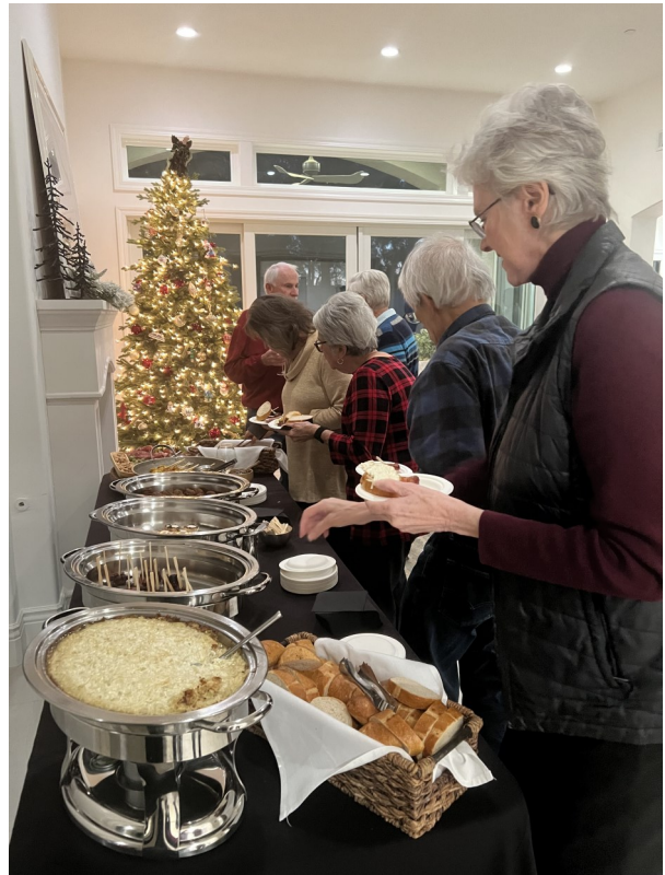
Enjoying great food & wonderful company!!!!!!