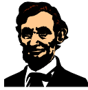
PRESIDENTS DAY—FEB 19

(f)= flyer in this issue , (tt) = see travel table