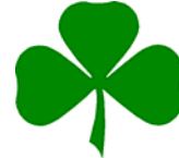
ST. PATRICKS DAY—MAR 17