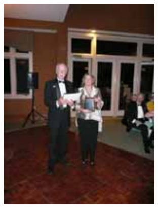
Man & Woman of the Year Awards