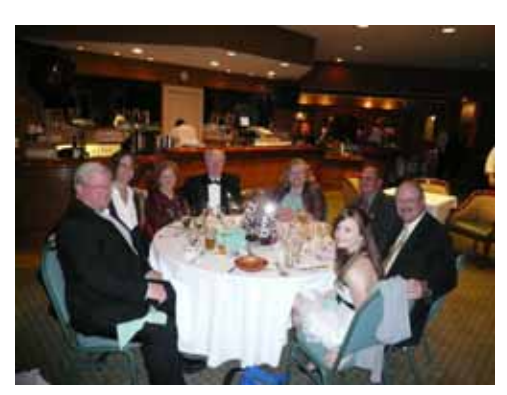
Good eats & good times!!