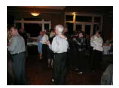
Dancin' the night away!!